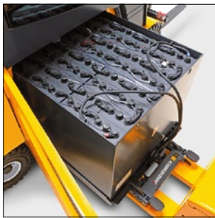
Sideways battery removal