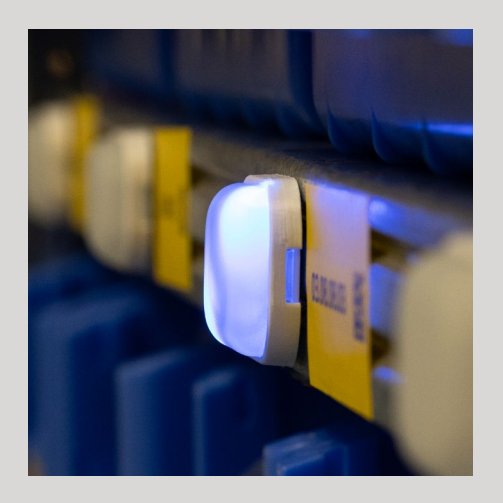
ASSEMBLY - the LIGHT TAG is attached to the storage rack via an adhesive strip or magnet