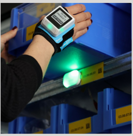
COLORS AND PATTERNS - the LIGHT TAG can display any color and pattern