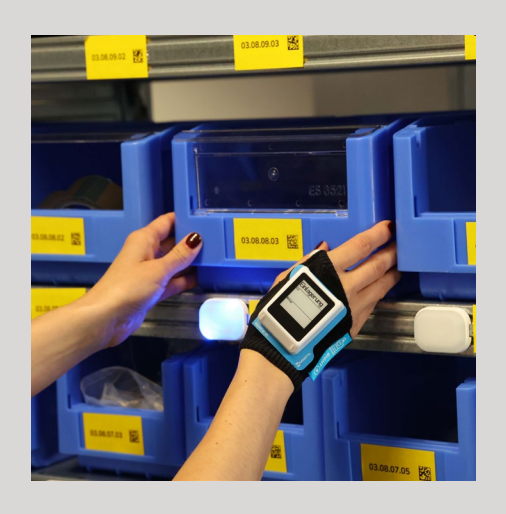
NO INTEGRATION EFFORT - the smart is in the HS 50 and the LIGHT TAG communicates with it

80% EFFICIENCY INCREASE ALL COLORS AND PATTERNS EASY PAIRING LONG BATTERY LIFE NO INTEGRATION EFFORT