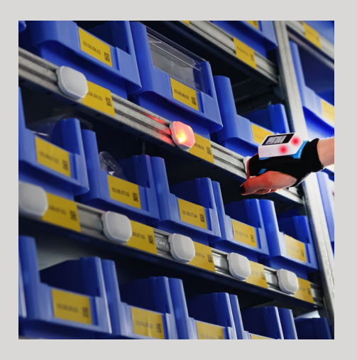
BATTERY LIFE - the life of the battery is 3 - 5 years