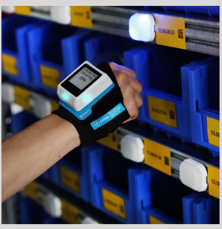
EASY PAIRING - the LIGHT TAG and the corresponding storage location are scanned and finally paired