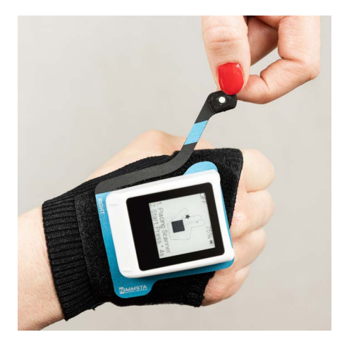
ERGONOMIC - ERGONOMIC SCANNER & TRIGGER PAD INDIVIDUALLY POSITI-ONABLE