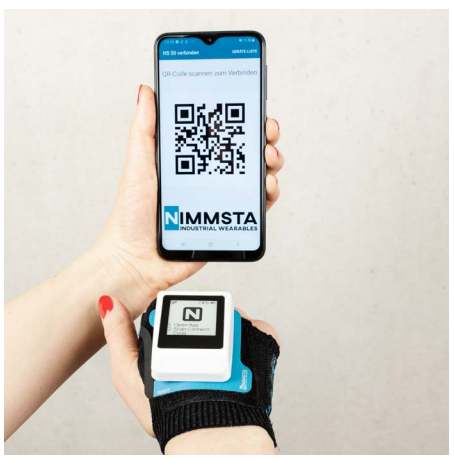
EASY PAIRING - EASY PAIRING VIA QR-CODE