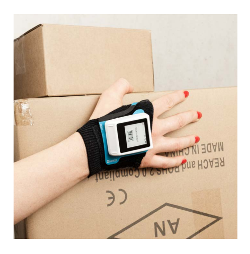
FREEHAND SCANNING - THE FIRST BACKHAND SCANNER WITH TOUCH DISPLAY