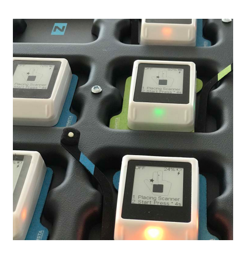
WIRELESS CHARGING - LOAD STATUS AT HS 50