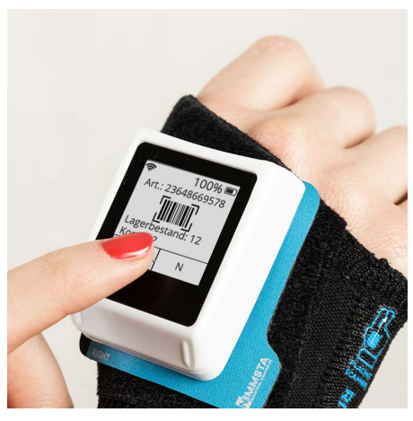
TOUCH DISPLAY - INTERACTIVE USER GUIDE