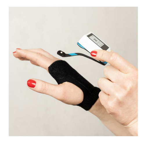
MODULAR - THREE COMPONENTS ONE APP